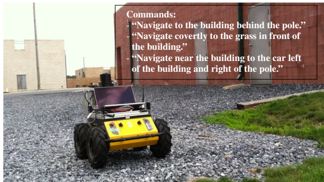
Figure 1: Clearpath™ Husky robot used in the experiments

method proposed in [Munoz, 2013] which has been proven effective in outdoor environments [Munoz et al. , 2010]. The semantic perception module receives scene images from a 2D camera and classifies each object into categories with different confidence values.